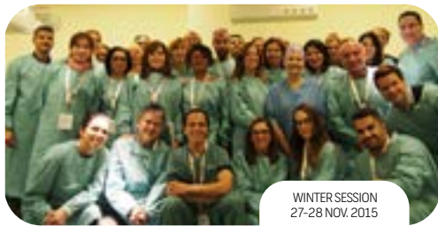
WINTER SESSION 27-28 NOV. 2015