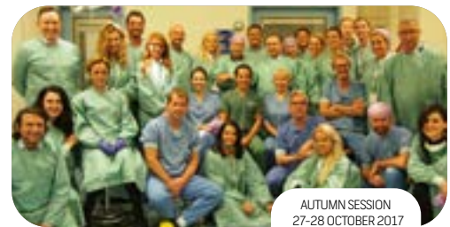
AUTUMN SESSION 27-28 OCTOBER 2017