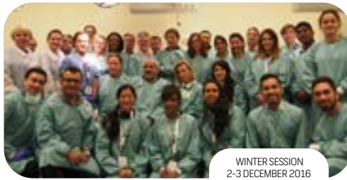
WINTER SESSION 2-3 DECEMBER 2016