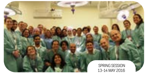
SPRING SESSION 13-14 MAY 2016