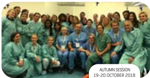
AUTUMN SESSION 19-20 OCTOBER 2018