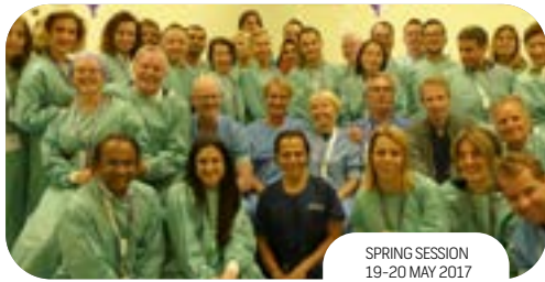
SPRING SESSION 19-20 MAY 2017