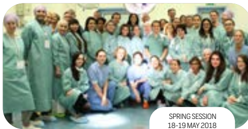
SPRING SESSION 18-19 MAY 2018