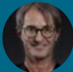
Dario Bertossi Facial Plastic Surgeon (Italy)